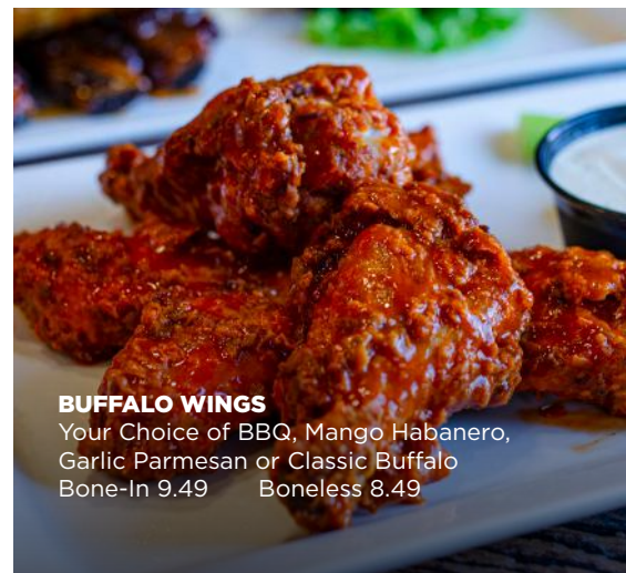
BUFFALO WINGS Your Choice of BBQ, Mango Habanero, Garlic Parmesan or Classic Buffalo Bone-In 9.49 Boneless 8.49

SPINACH ARTICHOKE DIP Creamy dip served hot with toasted focaccia bread 7.99